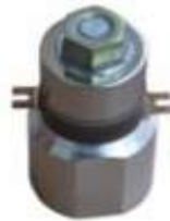
BJC-2850T -45SS PZT-4