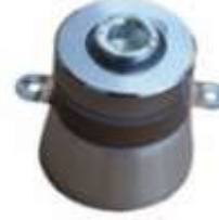
BJC-4060T -49HN PZT-8