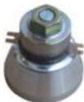
BJC-5435T -38HN PZT-4