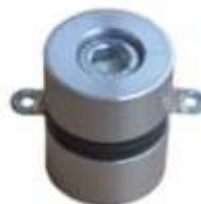
BJC-12060T -40SS PZT-4