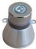
BJC-2560T -59HS PZT-4