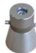
BJC-20100T -68HN PZT-8