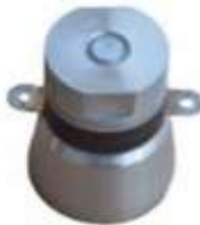
BJC-4060T -48SS PZT-4