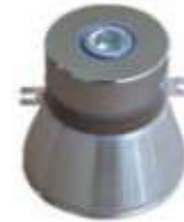
BJC-2860T -59HS PZT-8