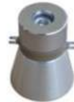
BJC-4060T -49HN PZT-8