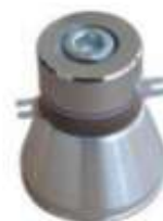
BJC-28100T -68HN PZT-8