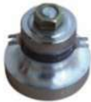
BJC-25(40)/50T -64HS PZT-8