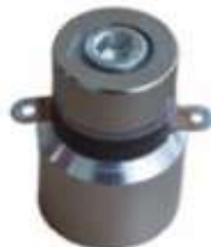
BJC-6860T -49SS PZT-8