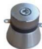
BJC-28100T -68HS PZT-4