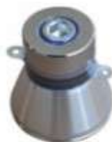
BJC-25100T -68HS PZT-4