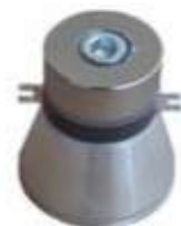
BJC-28120T -68HS PZT-4